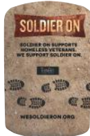
TA-SI 4 Custom Special Image