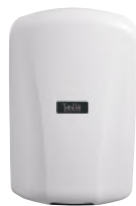
TA-ABS White Polymer (ABS)