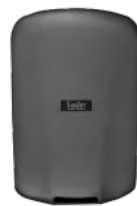
TA-GR Graphite Textured Painted