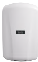
TA-W White Epoxy Painted