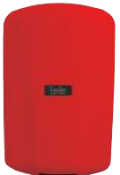
TA-SP 3 Custom Special Paint