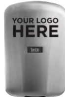
TA-SB-SI 4 Brushed Stainless Steel Special Image